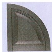
Raised-panel Arch Top* ARCH15RP